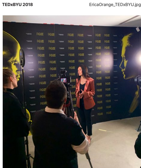
Future Tense Conference 2023