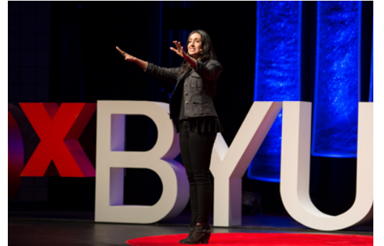
"The future is not just about innovation but imagination"